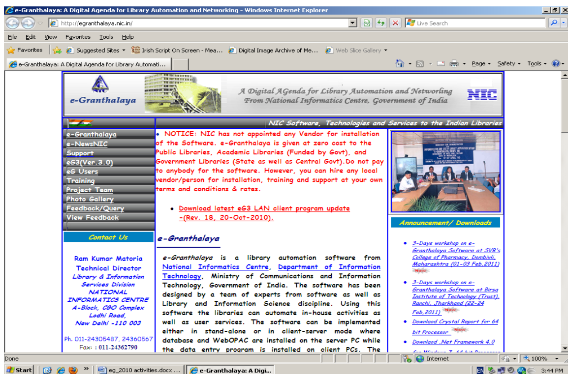
Fig.1: e-Granthalaya Home Page